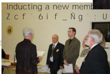
Inducting a new member