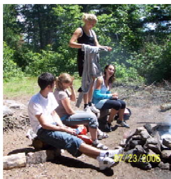
Algonquin Park Campsite

The Midland Lions hosted a tour of St. Marie Camp Huronda and Algonquin Park followed