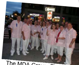
The MDA Group, First Night, out for a stroll