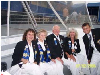
Water Taxi ride to the Belgium hospitality evening at the Marine Museum