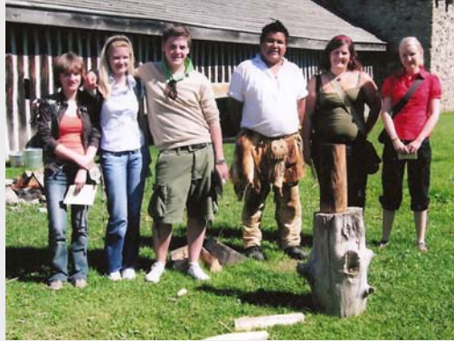
Ste Marie Among the Hurons in Midland

Please see A-12 Website for full story & pictures.